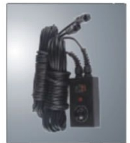
Remote control panel assembly